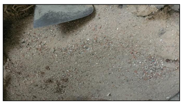
Fig 2. Recycled Fine Aggregate.

Properties of RFA were tested and following results were observed – Water absorption - 12% Specific gravity - 2.4 Fineness Modulus – 2.3 Silt content - 1% 3.1.4 Recycled Coarse Aggregate