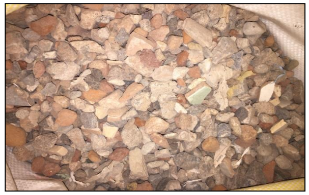
Fig 3. Recycled Coarse Aggregate.

Properties of RFA were tested and following results were observed – Water absorption - 12% Specific gravity - 2.4 Fineness Modulus – 2.3 Silt content - 1% 3.1.4 Recycled Coarse Aggregate