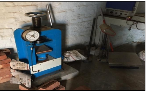
Fig 5. Compressive Strength Testing Machine.

It is the strength of a material and is defined as the value of uni-axial compressive stress reached when the material fails completely. The cubes were tested in accordance with IS: 516-1969. The loading rate was 10 kN/min and maximum capacity was 2000kN. The test setup is shown below in figure.