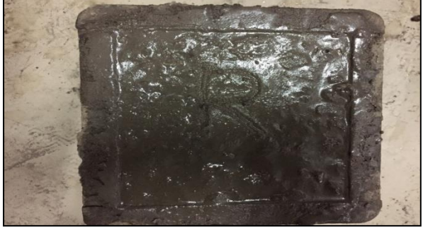
Fig 4. Recycled Aggregate Concrete Casted Cube.

The cubes of size 150mm x 150mm x 150mm were casted as per the procedure to determine the compressive strength after curing period for 7, 14 and 28 days. Figure given below shows the mixing and casting of cubes.