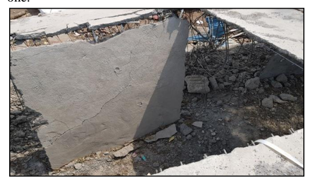
Fig 1. Demolition of Old Existing Structure.

Over the last five to six years, India's first and only recycling plant for construction and demolition (C&D) waste has saved the already-polluted Yamuna and the overflowing landfills of Delhi from 15.4 lakh tonnes of debris. A Ministry of Urban Development circular on June 28, 2012, directed States to set-up such facilities in all cities with a population of over 10 lakh. But, till now the existing facility at Burari is the only one.